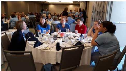
Intense game of Bingo was enjoyed by all !