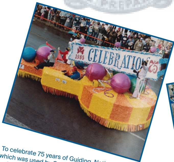
To celebrate 75 years of Guiding, National created a float which was used by Guiding in parades across the country. Here it was in Edmonton's Grey Cup Parade in 1985.

From small-town parades and celebratory rallies to waiting to greet royalty, Guiding members have always enjoyed the excitement of getting together with other members for a special occasion.