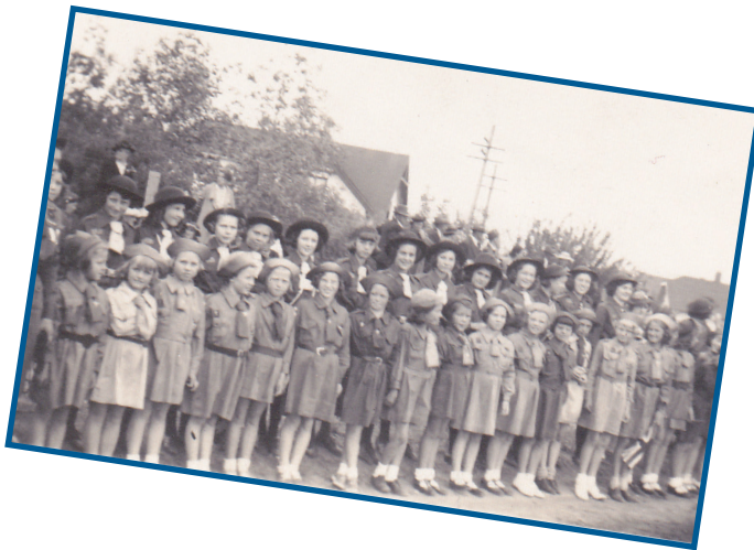
Left: Brownies and Guides line the procession route, waiting to greet King George VI and Queen Elizabeth in 1939.