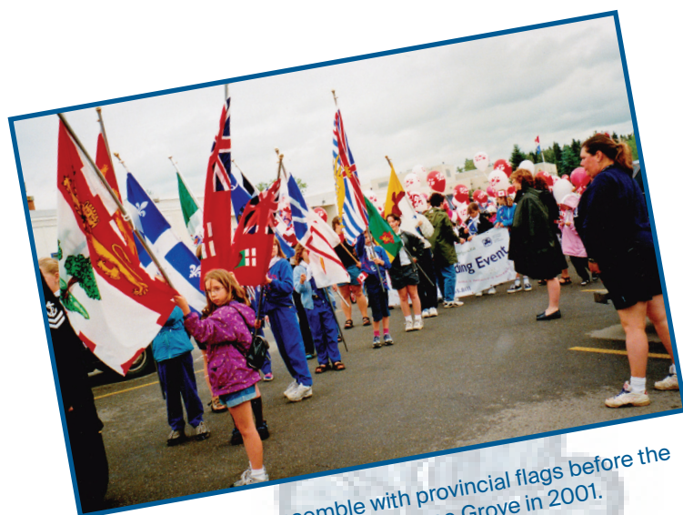
Guiding members assemble with provincial flags before the Canada Day Parade in Spruce Grove in 2001.

By Geoff and Janet Allcock, Archives Committee