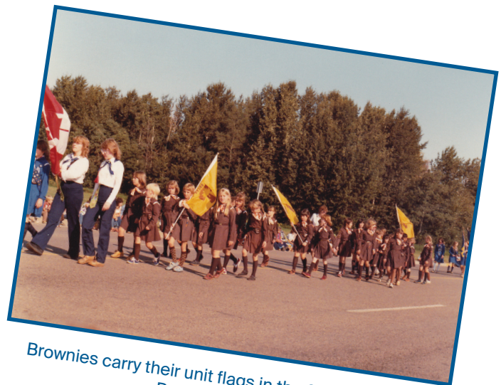
Brownies carry their unit flags in the Spruce Grove Parade, in 1982.