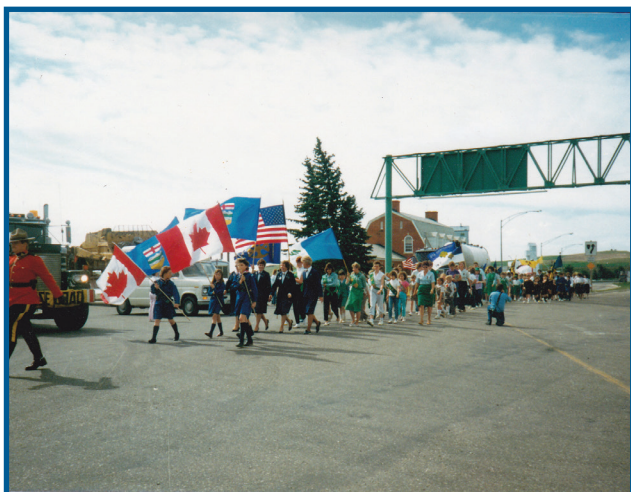
"Hands across the Border" events have taken place in many different parts of Canada. Here the Morning Star District hosts a parade across the border at Coutts, Alberta.