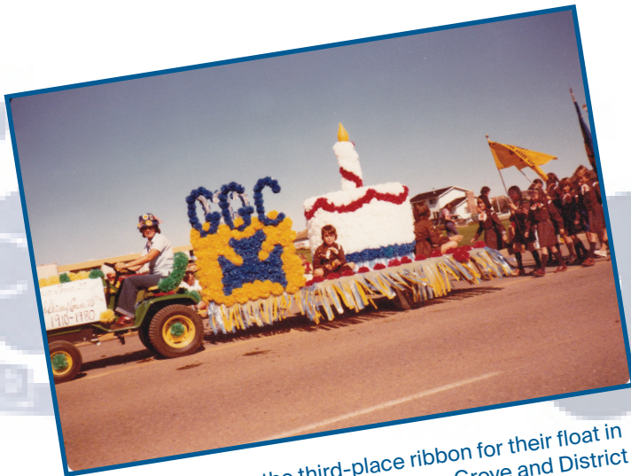
Local Guides won the third-place ribbon for their float in the Community Section of the Spruce Grove and District Agricultural Society Parade in 1980.