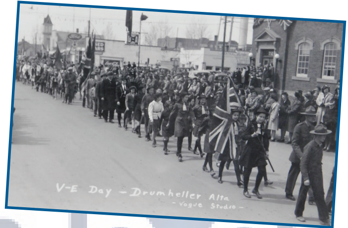
Guides took part in the V. E. Day Parade in Drumheller in May 1945.