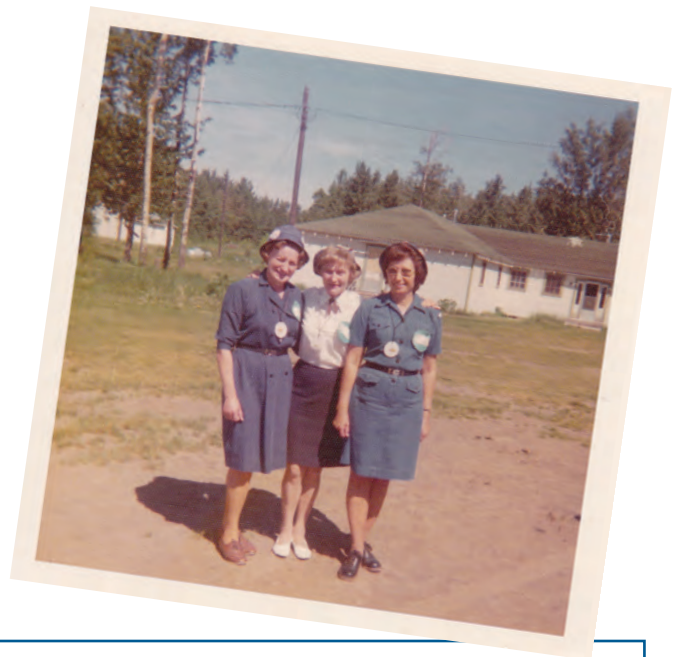
Guiders of the 1st Edmonton Pack (Alex Taylor School) at camp in 1973. The Guider on the left is wearing the earlier style of the “cocktail” dress.

Are you wondering what we do with items that really are duplicates? We try to use them for displays or educational purposes and sometimes we give them to the silent auctions at events such as the AGM to raise money for CWFF.