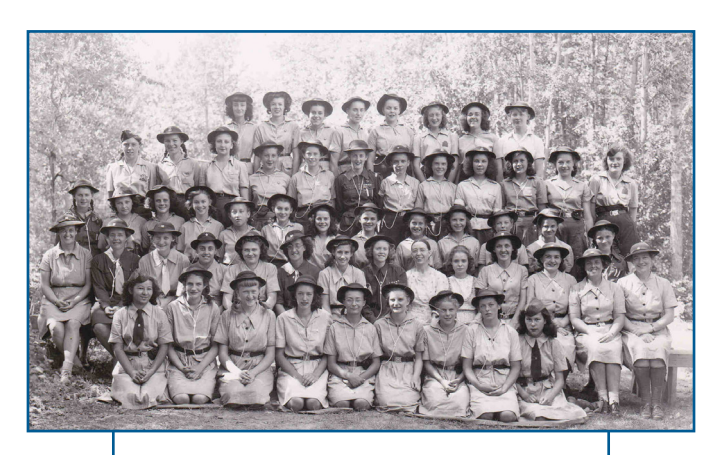
Patrol Leaders' Camp in 1946.

to this purpose. There would be a time scheduled into each meeting for Patrol time. As many units only had one adult leader, the Patrol Leaders were, in effect, acting as young leaders, but as Guides at that time were aged 11 to 16, that was appropriate.