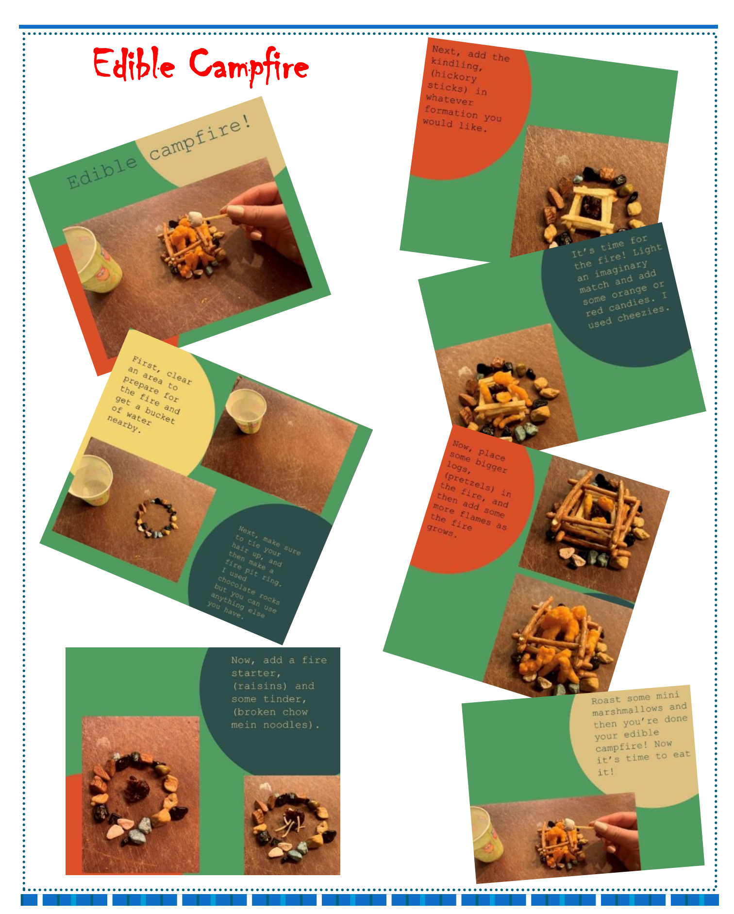
Special thanks to the British Columbia Youth Forum Rangers for contributing these activities.