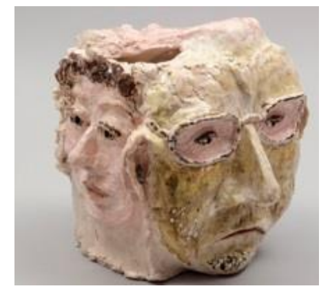
IF THESE WALLS COULD TALK BY ANONYMOUS, COURTESY OF THE GARDINER MUSEUM.

The exhibit is a good way to raise awareness, as it shows real life stories, and can be understood by many people, whether they have experienced violence, witnessed violence, or believe in ending violence.