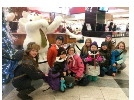
(Above) A stop to warm up at Place Ville Marie

(Right) Train ride home after a busy day!