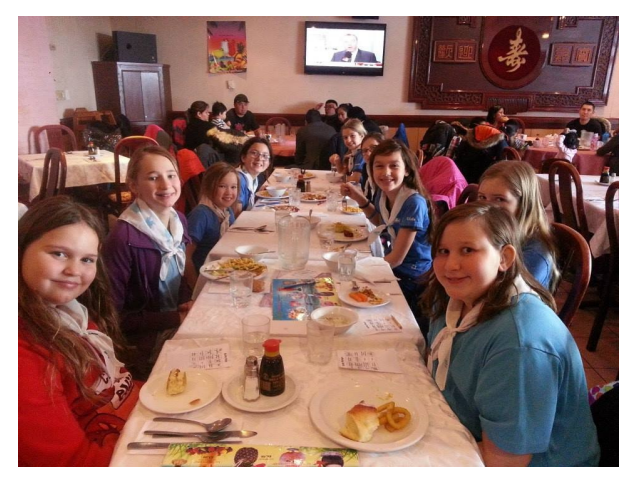
Lunch Bingo in Chinatown

"We visited Bonsecours market, Chinatown, the underground city, and the Christmas lights on McGill College Avenue, and then a train ride home!" - <u>Valois-Dorval District Facebook Page</u>