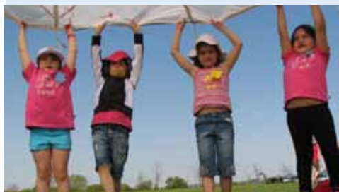
Sparks in Brandon, MB, greet Rally Day.

On May 15, 2010, 48,000 Girl Guides from coast-to-coast-to-coast gathered to celebrate the 100th Anniversary of Girl Guides of Canada. The day began with a sunrise ceremony in Newfoundland and concluded with a gigantic sleepover in Vancouver. Girls across the country participated in a host of activities from tug-of-wars and nature activities to a flash mob dance and of course, enjoying birthday cake! Check out videos and photos from across the nation at http://2010.girlguides.ca .