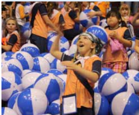
A Brownie shoots a beach ball high into Vancouver's Pacific Coliseum