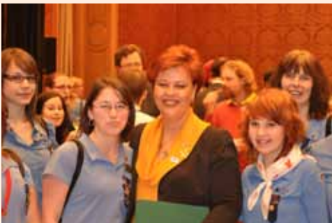
Alexandra Mendes, MP, Brossard-LaPrairie sponsored the event on Parliament Hill. Justin Trudeau celebrates with some of our girl Members.

In March, our 100th anniversary celebrations touched down in Ottawa with our 100 on the Hill event. Girls had the chance to tour the House of Commons before participating in a special reception recognizing GGC for 100 years of helping Canadian girls become confident, courageous and resourceful leaders. Among the guests were the Speaker of the House, Senators, party leaders and MPs.