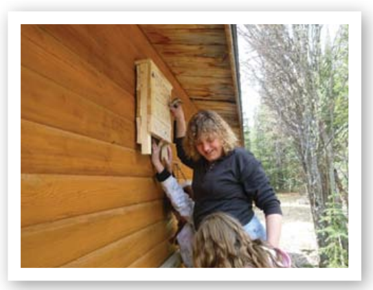
Positioning and hanging bat house

Of course the fire will grow to be its warmest when we discover that bat families have made their home in our bat houses.