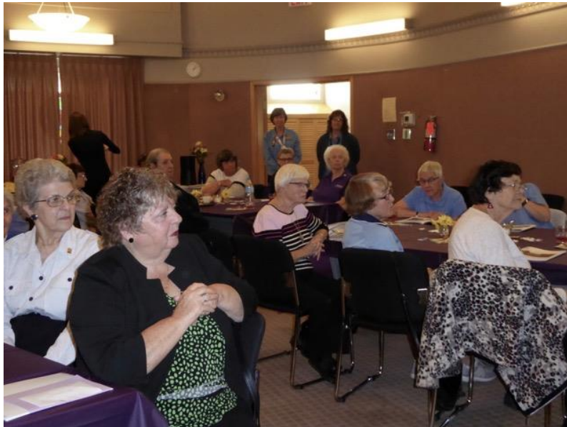
Calgary's Thinking Day Tea

We still keep the spirit alive by attending some Area functions, such as a Thinking Day event when possible, and the Calgary Area Trefoil Tea which the Area Guild has been hostessing for this our third year. It is fun to see other Calgary Trefoil members and get caught up on Guiding initiatives and we appreciate our Area having this gathering yearly. We cherish the friendships made many years ago. Girl Guiding brought us all together as a group and we continue to enjoy keeping in touch.