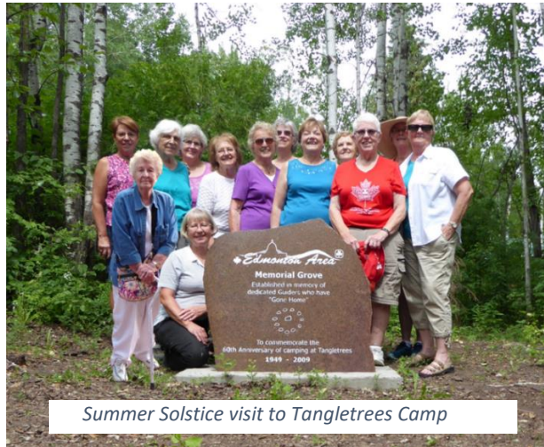
Summer Solstice visit to Tangletrees Camp

June was the AB Council Roundup in Red Deer which we attended and then we held our annual Summer Solstice event at one of our member's cottage on Pigeon Lake where we spent a wonderful day socializing, eating and doing activities including a meeting.