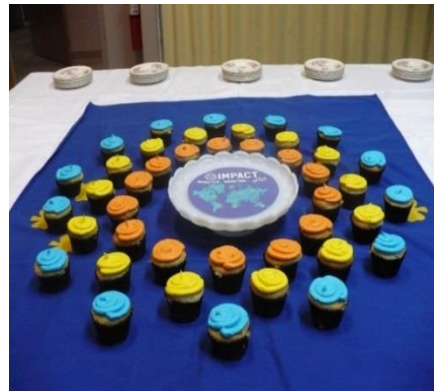
Cupcakes arranged to replicate WAGGGS IMPACT logo