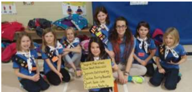
Brownies: Love Yourself Challenge