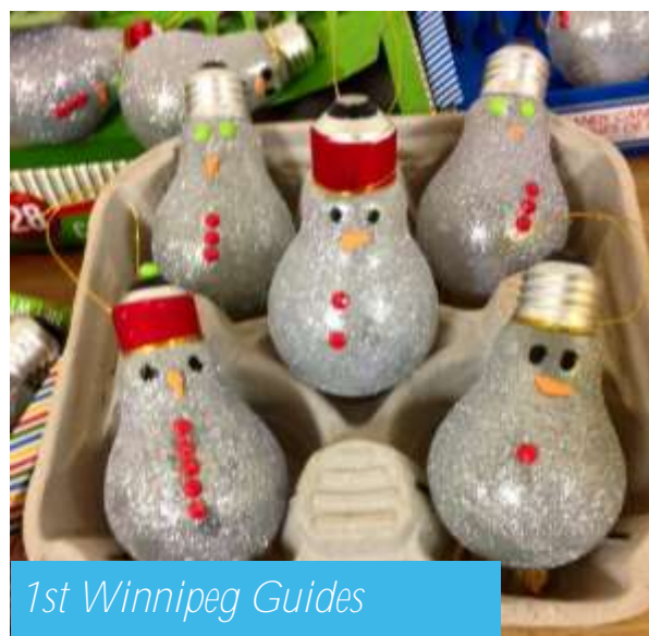
1st Winnipeg Guides