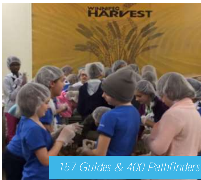
157 Guides & 400 Pathfinders