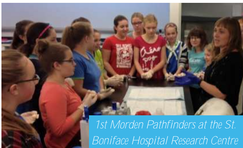
1st Morden Pathfinders at the St. Boniface Hospital Research Centre