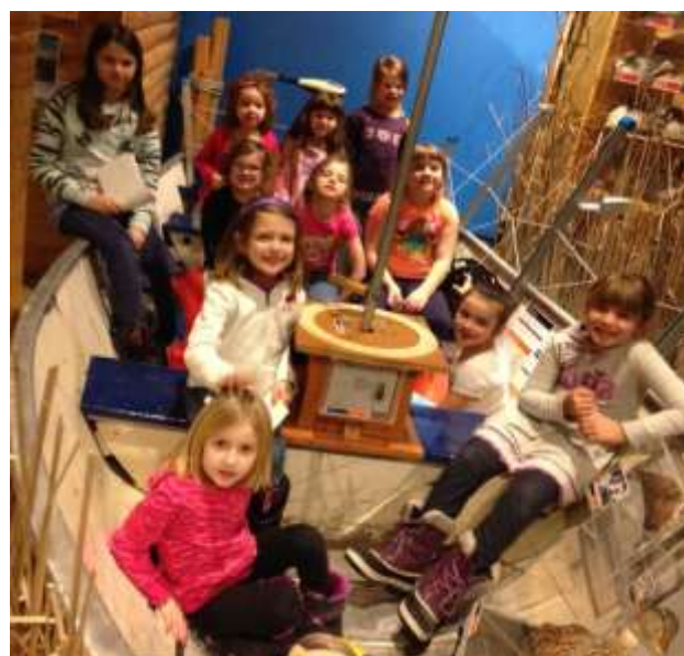
1st Brownies & 266 Sparks