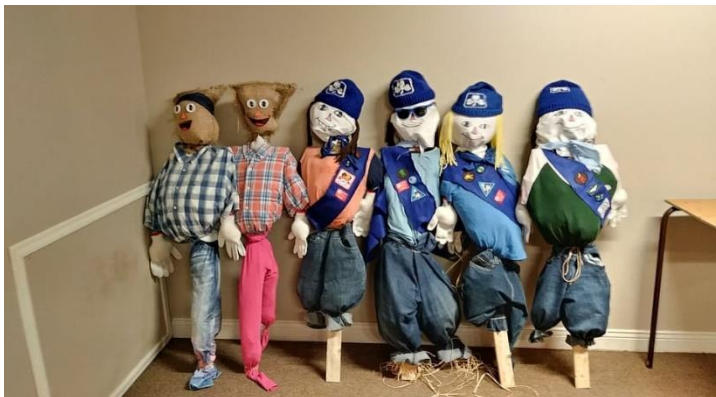
The Spring Park Guides, Cornwall Guides, Pathfinders and Rangers spent a Saturday morning making scarecrows for the Charlottetown Scarecrow festival

While our Provincial Office remains closed, we were pleased to be able to host unit meetings, which helped a few units who were displaced due to facility issues with Covid 19.