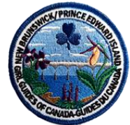
NB/PEI Provincial Crest