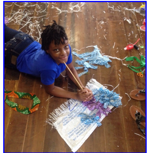
Above: SVG Guides make "poke mats" a traditional Newfoundland craft, featured in the twinning culture sharing guide "Let's Meet Atlantic Canada".