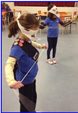
Above: 2nd Timberlea Brownies play the "Make the Shape" game from the Twinning2020 "#Shareit" activity guide. According to the Brownies, "it was much easier to make the shape as a group because if you were alone, you'd just be dragging the rope around".

As part of the initiative, units in Atlantic Canada were invited to try out the activities as part of World Thinking Day 2015 and share experiences through submitting photos and comments that can in turn be shared with Saint Vincent and the Grenadines. See below for a short overview of some unit activities as well as some pictures of Guides in SVG trying out some Atlantic Canada activities.