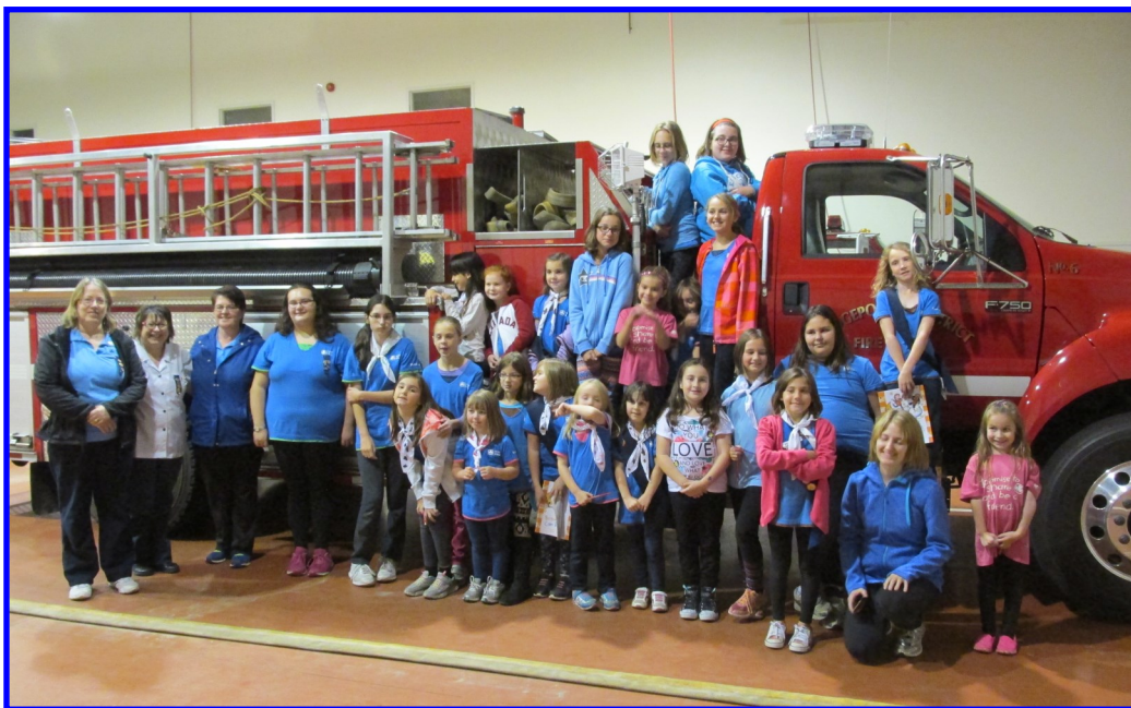
Left : Wedgeport Units learning about fire safety

Units within Western District are very busy working on their program, camping and taking part in events in and around their communities such as parades, ceremonies and helping out where ever they can. However, we love to get together for events as a District as well. Each year the Guides, Pathfinders and Rangers throughout the District get together to go winter camping, and in the summer attend Camp What Knot (described by most girls as "the best camp ever"). In 2015, the Sparks and Brownies got together in March for what is likely to become the 1st "Annual" Spark/Brownie Snowball where everyone came dressed as a princess to take part in dancing, crafts, face painting and making lots of new friends. Units from all levels get together throughout the year as well for events such as "Girl Guide Night" at the Mariner's hockey game, a family skating party over the holidays and the "Friendship Rally", which is a one night camp for all levels of Guiding.