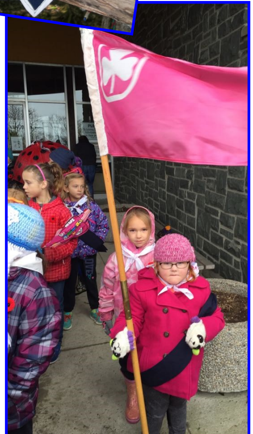
Above: Yarmouth Units getting ready to participate in the Remembrance Day Ceremony.