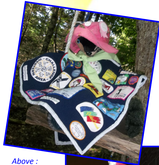
Above : Diversity Bear