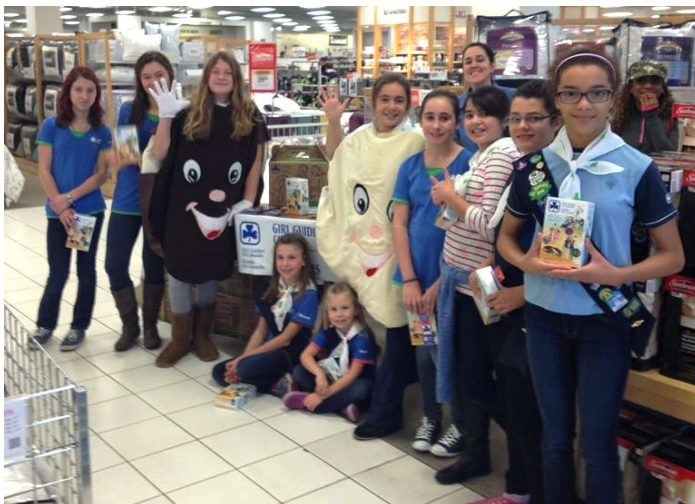
Top left and above: Pointe-Claire cookie sellers; Left: Cookie sellers from Northern Lights District.

Check out page 6 for more photos from the fall 2014 campaign!