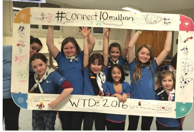
All smiles at Secteur Argenteuil's district Thinking Day event